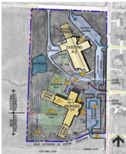
Site plan for the proposed renovations and additions to the School District's facilities

The scope of work for the existing 3rd-5th and 6th-8th grades on the North side of the school property is primarily focused on a ground source HVAC system and Electrical upgrades.