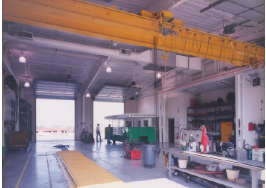
Boone Electric Vehicle Maintenance Facility.

Boone Electric, founded in 1936, has experienced phenomenal growth along with the area it serves. To accommodate this growth, the new addition nearly doubles the existing office area, as well as the vehicle maintenance service facility. Furthermore, all areas now conform to present day codes, including ADA.