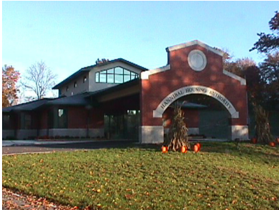
The entrance to the Hannibal Housing Authority Administrative Offices features a portico at the entrance to the office.