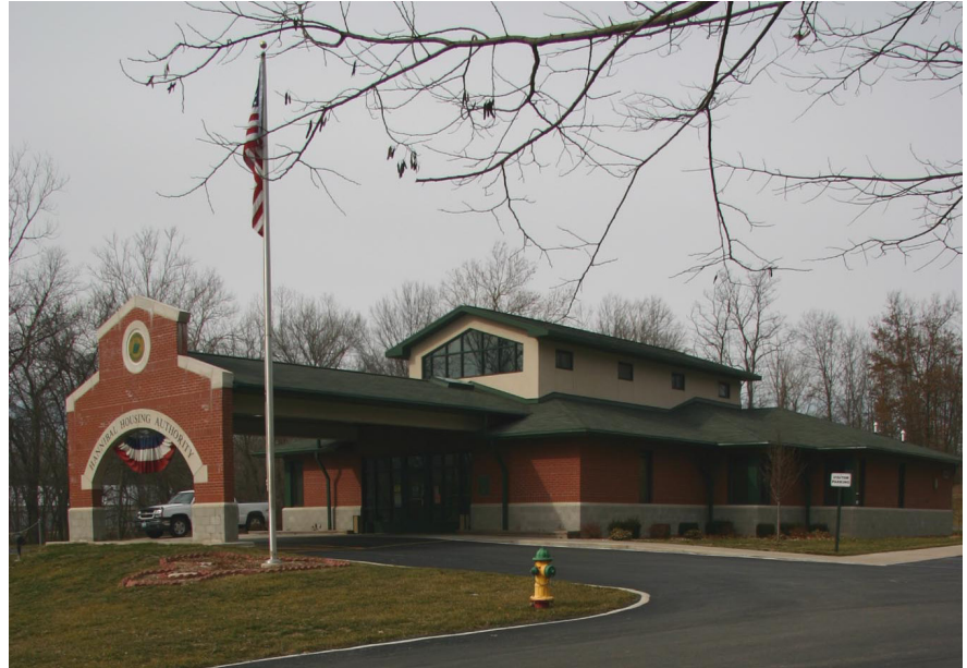
The Hannibal Housing Authority Administrative Office Building includes many sustainable design practices.