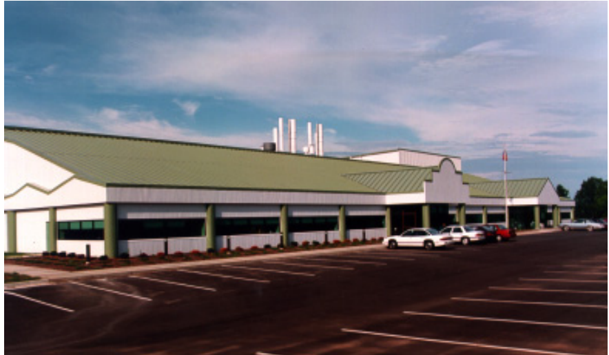
The quality of workers available in the community was a major concern for TEXTRON.

To encourage development, many communities compete to attract corporations that are planning business expansions. Columbia's strong, stable local economy and the work ethic of the communities people, enticed the division of TEXTRON, Inc. to choose Columbia as the location for its new automated production, manufacturing and administrative headquarters. Davidson Instrument Panel began in 1857 as the Davidson Rubber Company. As a division of TEXTRON, the company grew to become the world's largest independent automotive instrument panel producer. Now named TEXTRON/Automotive Interiors,