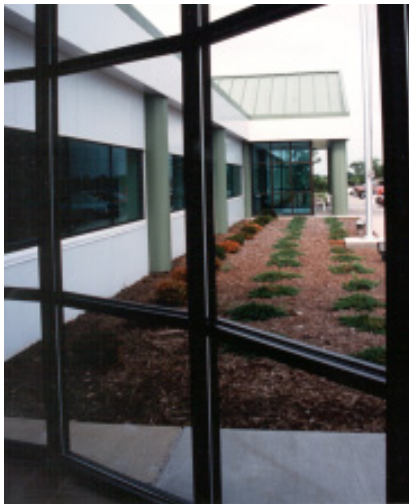
Although an industrial building, TEXTRON is inviting to visitors.