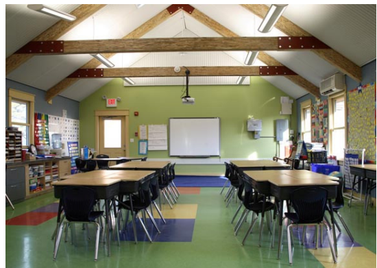
An interactive SMART Board, low VOC paint/adhesives, custom cabinetry, an acoustical wall and ceiling treatment, and GREENGUARD® certified furniture are a few of the features that combine to create an ideal learning environment.